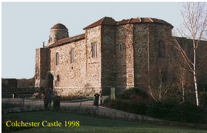
Colchester Castle 1998

By the twelfth century the town had expanded far beyond its walls. The Royalists were besieged by the Roundheads in the town in 1648 during the English Civil War and by 1856 the town had become the garrison town which it remains today.